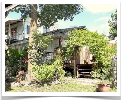
Arco Iris Permaculture Farm